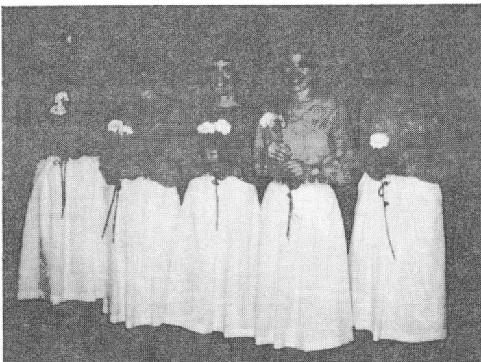
SON-SHINE SIGNERS --Pose for a group picture following their 200th performance June 8 at Omaha.