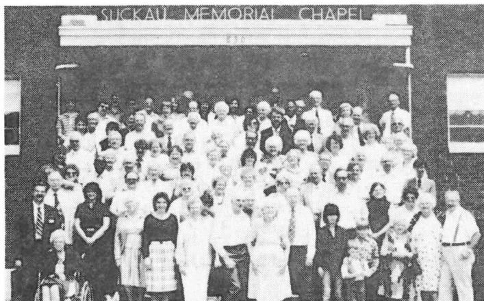
MIDWEST CONFERENCE--Group picture taken after church services Sunday morning. (More photos on P. 5)

The 1986 meeting will be held at Estes Park, Colo.